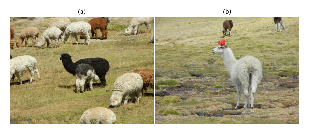
Figure 5. The traditional (camelid) grazing animals of the Peruvian High Andes: (a) alpacas and (b) llamas.

Andean communities collectively own their grazing areas on natural grassland (including