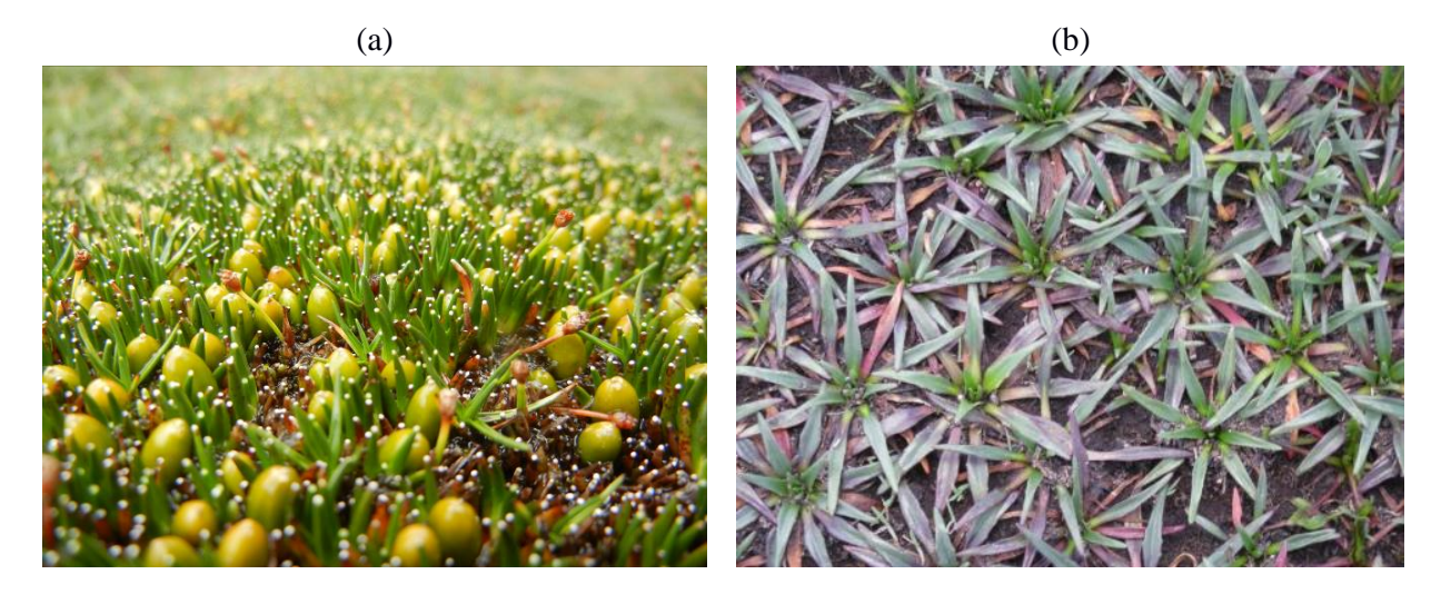
Figure 3. (a) Distichia muscoides Nees & Meyen and (b) Plantago tubulosa Decne.

according to Ramirez (2011), it is possible to find a third species, namely Distichia filamentosa Buchenau, in Peruvian bofedales (Ancash). D. filamentosa has been recorded in Bolivian and Chilean bofedales (Ruthsatz 2012), which means it is very likely also to be present in southern Peru.