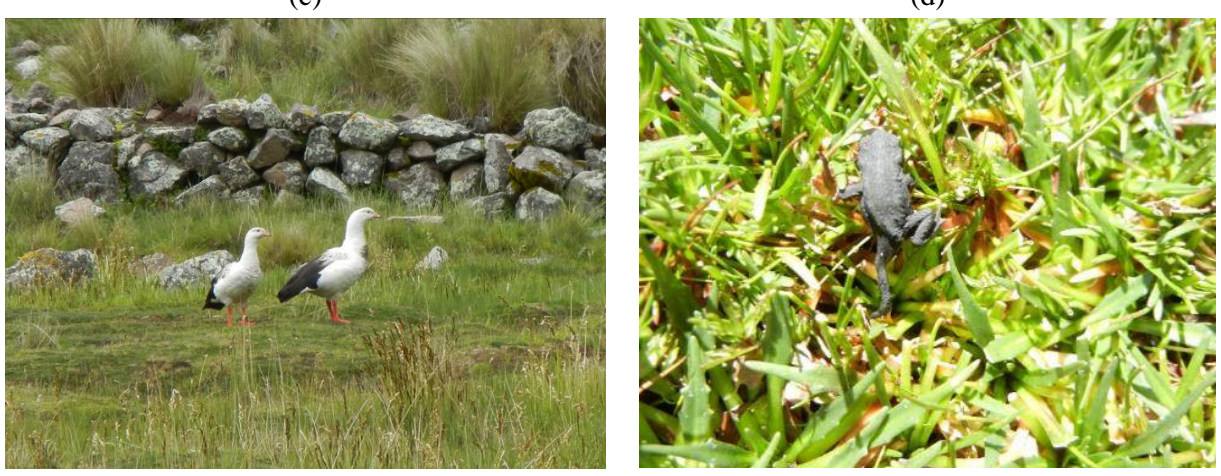
Figure 4: Some of the wild fauna of Peruvian bofedales: (a) "vizcacha" Lagidium peruanum on Distichia peatland (Moquegua region 2013); (b) ducks on Distichia peatland (Moquegua region 2014); (c) "huallatas" (Andean Goose Chloephaga melanoptera ) on peaty meadow (Cusco region 2012); and (d) the toad Rhinella spinulosa on peaty meadow (Ayacucho region 2012).