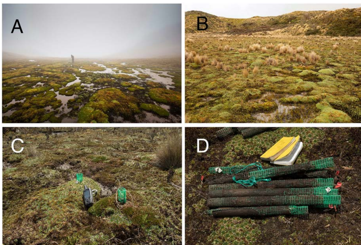
Figure 1. Study sites located in the páramos of Cayambe-Coca National Park (Northern Ecuador), on cushion plant dominated peatlands at (A) 4300 m a.s.l. and (B) 4200 m a.s.l. Panels C and D depict the ingrowth bags that were used to measure root production.

The two peatlands that we studied are dominated by P. rigida and D. muscoides , which together cover 60–70 % of the surface area of each site. D. muscoides tends to dominate portions of the peatlands with higher water table, while P. rigida can occur throughout the peatlands but tends to show