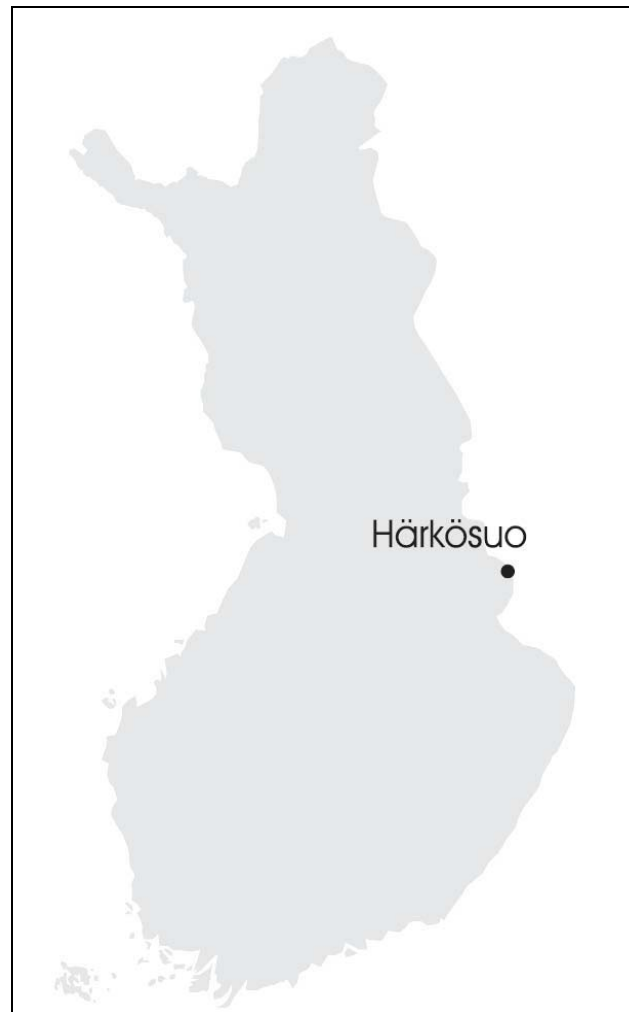
Figure 1. Location of Härkösuo Mire within Finland.