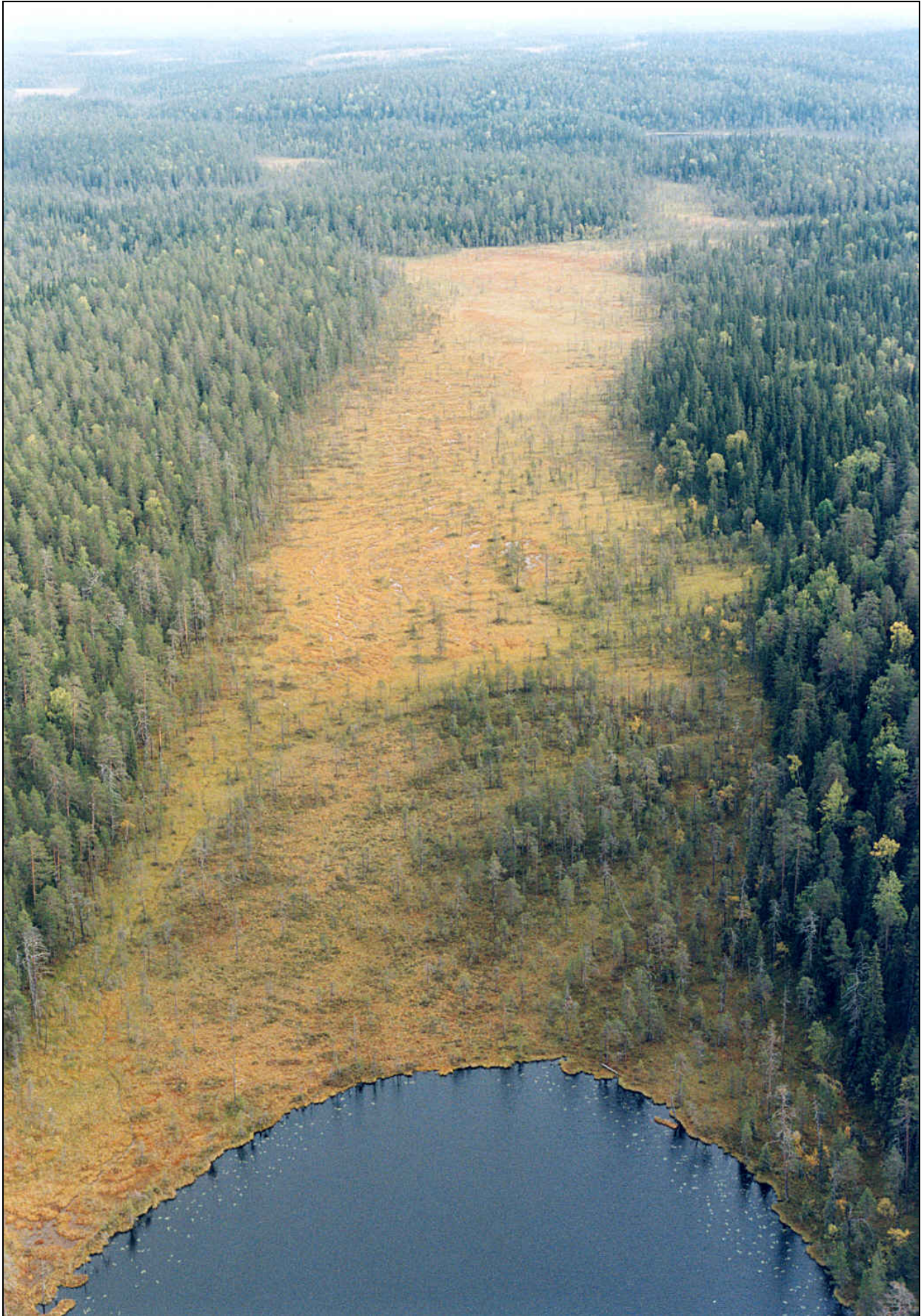
Figure 2. Oblique aerial photograph of Härkösuo mire from the west (September 1997).